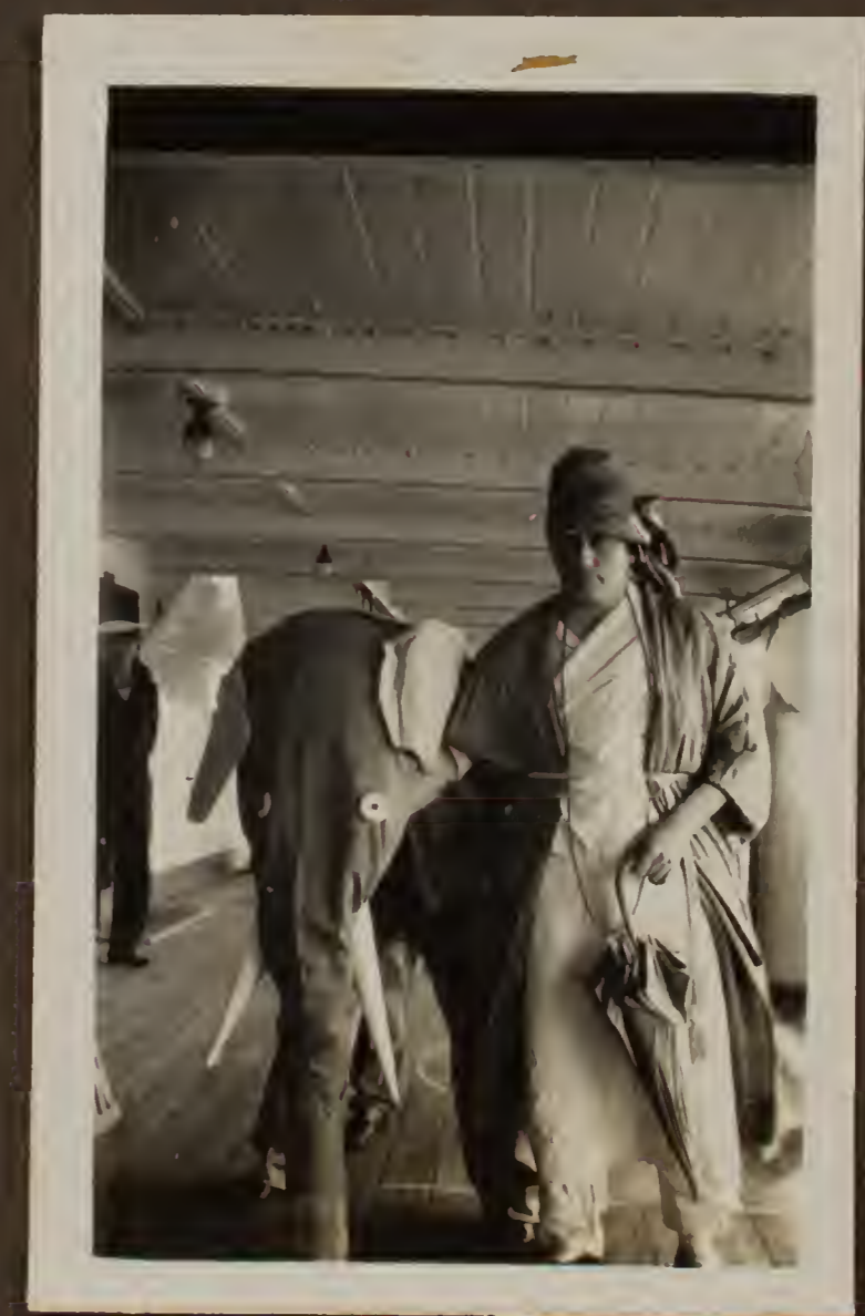
Man from camp B.M.S. Othman, Fancy Dress Bull 23 11 14